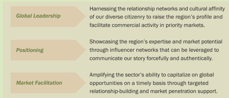
Figure 3 – Priority Action Areas

The recommended tactics to follow propose a variety of ways for regional partners to fulfill green sector international marketing and business development objectives. As outlined below, tactics have been designed to enable the City to tailor its investments around varying degrees of engagement, ownership and oversight with respect to tactic implementation.