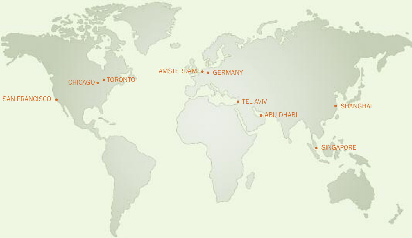
Figure 4 – Green Sector International Marketing Best Practice

As was identified in the 2007 People, Planet & Profit report, the green sector landscape is already dotted with many examples of global best practice. With growing recognition of the multi-faceted benefits that accompany green economic activity, many jurisdictions are simultaneously investing in local green sector development, and engaging the international community through well-defined communications platforms. Figure 4 highlights jurisdictions whose international marketing tactics are profiled in this section, and analyzed in further detail in Appendix D. Close examination of these practices is critical for developing a unique and authentic positioning strategy for the Toronto Region.