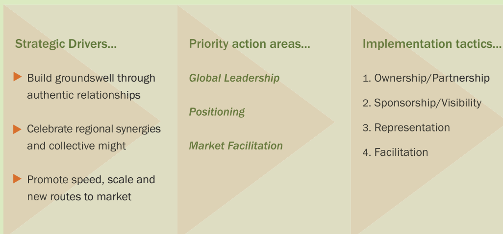
Figure 2- Strategic Marketing Framework

2008 International Marketing Charrette Participants