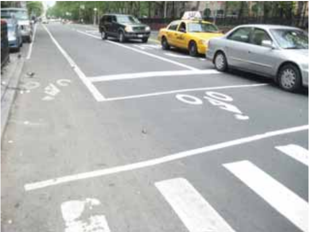
Example of a bicycle box in New York

Bicycle boxes are used to improve cyclists' safety at intersections by allowing cyclists to wait in front of cars at red lights. Bicycle boxes reduce conflict between drivers turning right and bicyclists going straight. They also provide a protected waiting space for left-turning bicyclists.