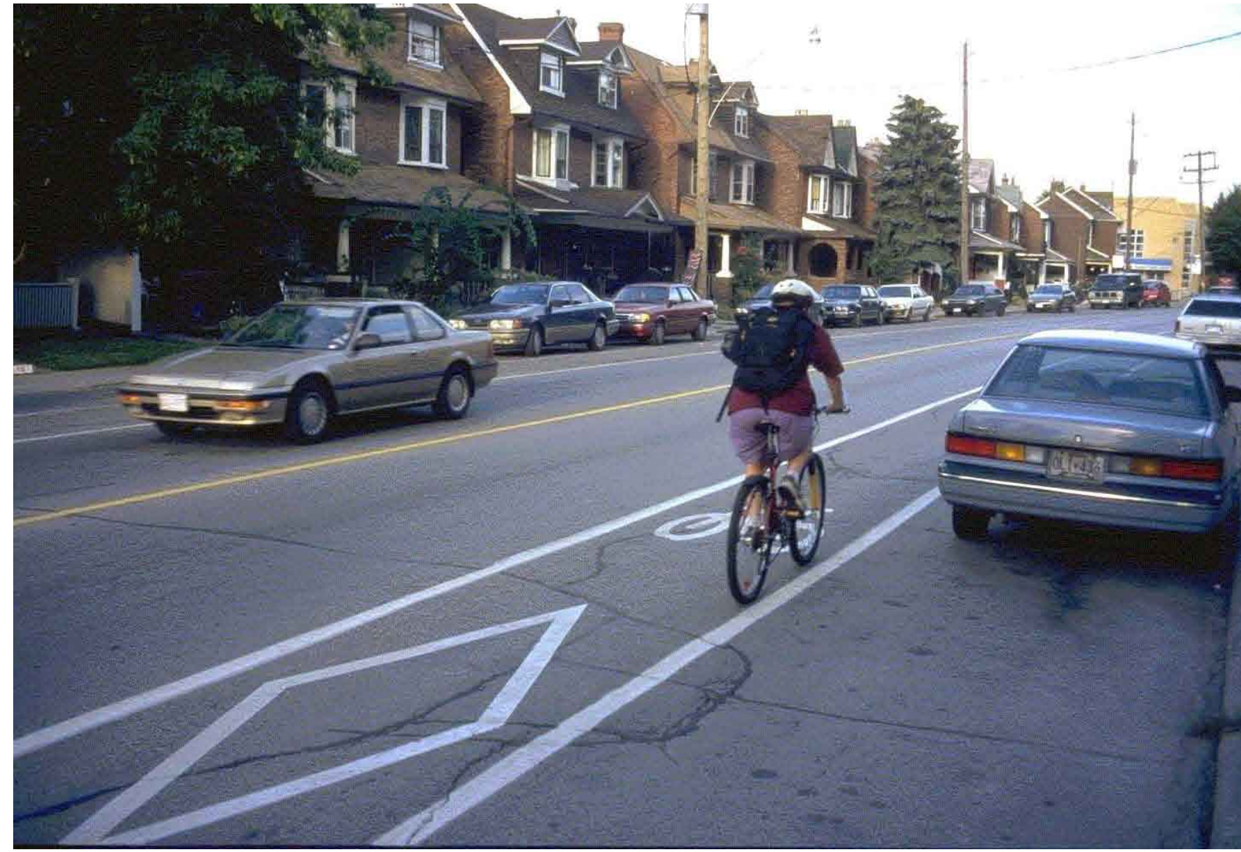
Standard bike lanes