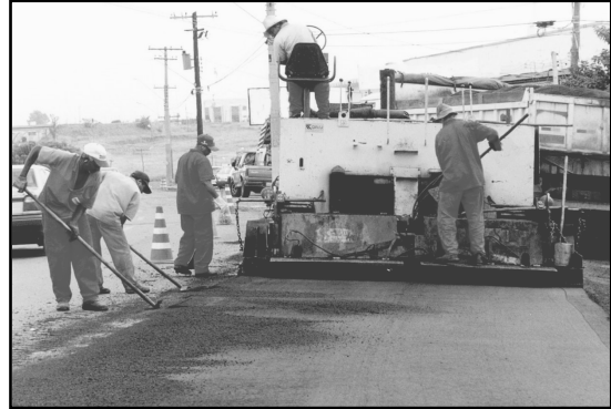
Example of asphalt paving

Drainage and alignment improvements may be made where side streets intersect with Westhumber Boulevard.