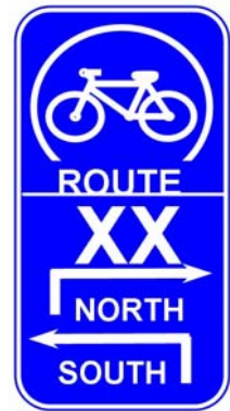
Example of Signs

The new off-road asphalt pathway will be 3.5 metres in width and runs approximately 4.5 kilometres from Marcos Blvd to Orton Park Road, through the Gataineau Hydro Corridor.