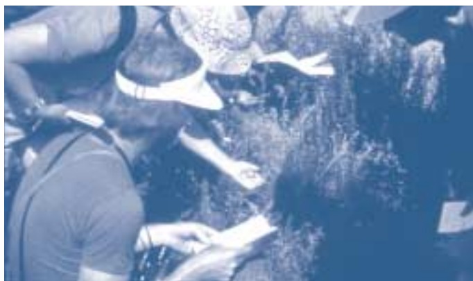
Volunteers identifying vegetation in the Don.

Bring Back the Don volunteers deliver an impressive level of dedication to the job. Without such dedicated volunteers our goal of a clean and green Don River Watershed would simply not be possible.