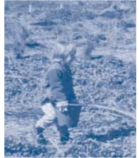
North Toronto Treatment Plant Spring 2001 Maddie Ritter - 3 1/2

Located behind the Loblaws grocery store on Redway Road (off of Millwood Road between Laird Drive and the Leaside Bridge over the Don). Look for the blue and white North Toronto Treatment Plant signs and head down the hill into valley.