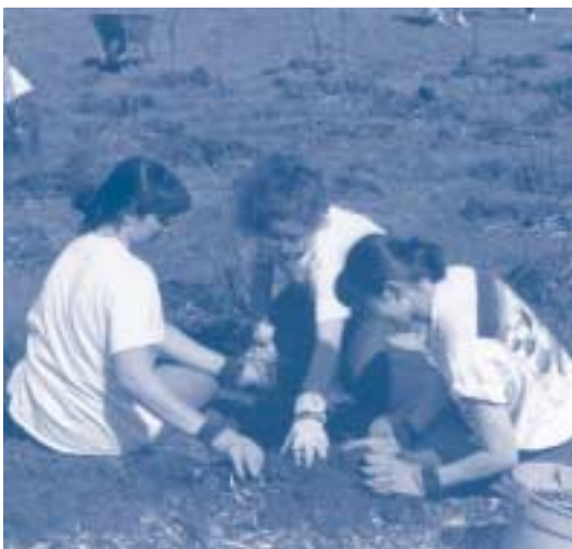
Volunteers planting along the East Don

This is the International Year of Volunteers, and the Task Force celebrates the work carried out by volunteers around the world. Most of our efforts to restore the Don Valley to its natural state would be impossible without volunteers. Your efforts are appreciated!