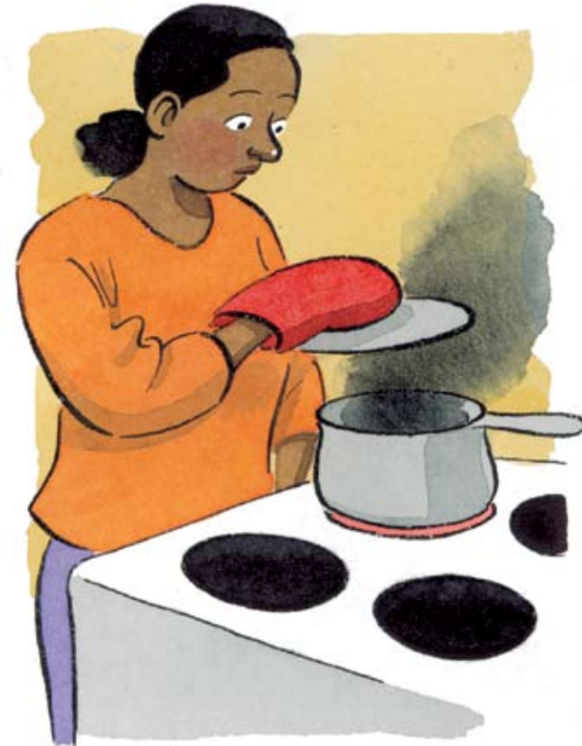
Putting a lid on kitchen fires