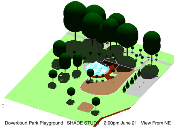
Dovercourt Park Playground SHADE STUDY 2:00pm June 21 View From NE