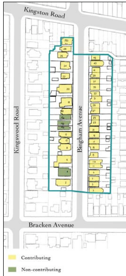
Figure 20. Heritage Evaluation – Bingham Avenue

The majority of properties along Bingham Avenue are recognized for their contextual value in establishing a ‘visual lineage’. This aesthetic relates strongly to architectural attributes such as the proportions of porches, window openings and height, as well as the integrity of construction materials, palette and detail. A number of houses along Bingham Avenue have been altered and have been evaluated based on the reversibility of these changes and their representation of the street’s existing architectural character. As well, new developments have been evaluated on their ability to relate to the existing heritage features of the street.