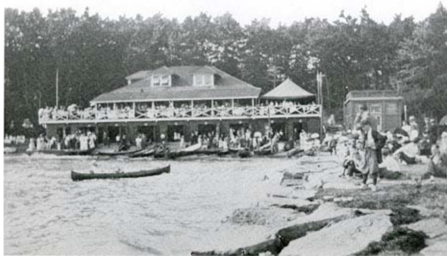
Figure 9. Balmy Beach Clubhouse, 1905-1936