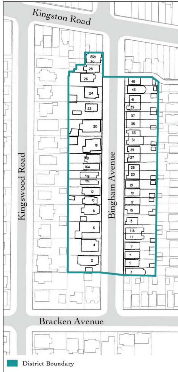
Figure 2. Heritage Conservation District Boundary – Bingham Avenue

The house types and streetscape features of Bingham Avenue represent a settlement pattern that is unique to this area of Toronto, and that has been identified by the city as distinct from adjoining streets. This Heritage Conservation District Plan proposes a district boundary that includes the existing residential lots and structures fronting on Bingham Road from number 2 to 45.