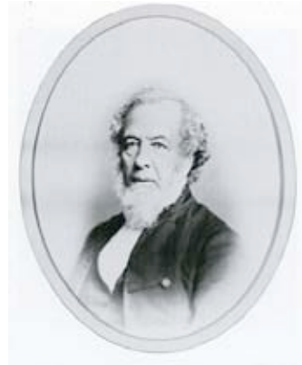
Figure 5. Adam Wilson, 1814-91