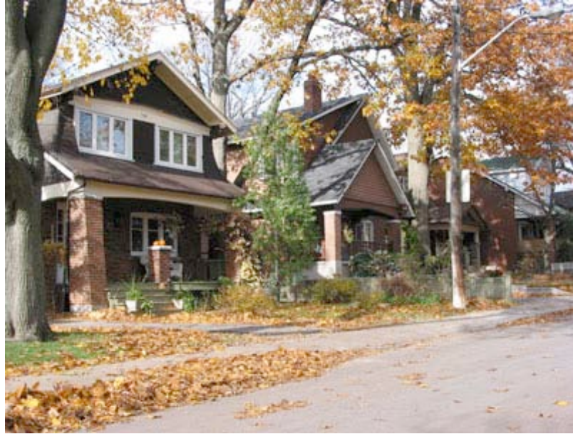
Figure 3. Looking along the west side of Bingham Avenue, 22, 24 and 26