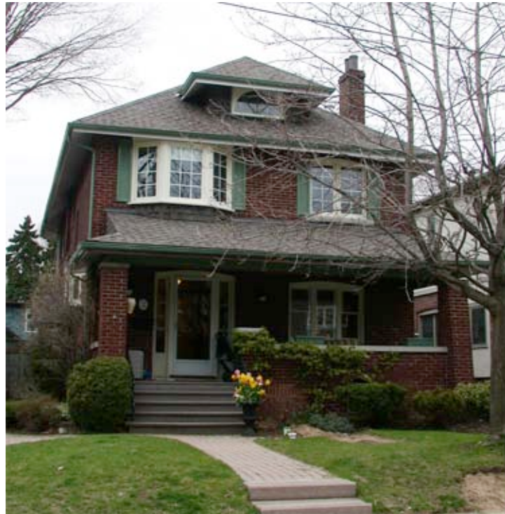
Figure 15.2 Bingham Avenue

A number of the houses on the street can be identified as having distinct features of Edwardian Classicism with simple, balanced (if not symmetrical) designs, and many windows. This practical house type, often constructed of brick, displays robust but simple wood detailing. These homes present a degree of formality in contrast to the more casual bungalow styles on the street, but relate well through modest 2.5 storey massing, shared setbacks and rustic detailing.