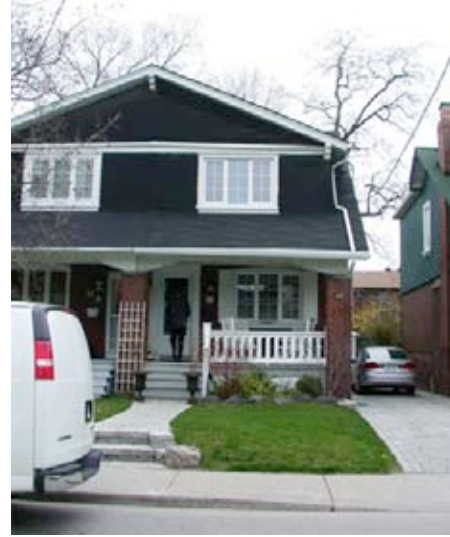
Figure 17.11 Bingham Avenue