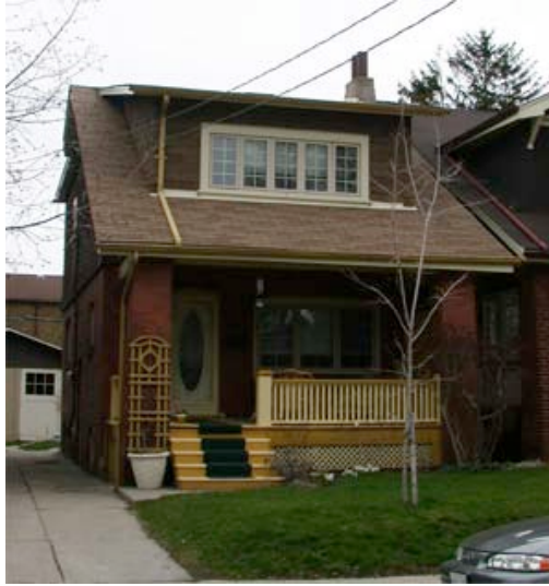
Figure 16.7 Bingham Avenue

Bungalow refers to a style of house popularized in the United States before WWI and consists of low cottage-like houses of 1 to 1.5 storeys. A good number of the homes along Bingham Avenue exhibit low-pitched roofs, wide verandas and varied building materials, which are characteristic of Toronto versions of this style. This design's modest proportions and rustic textures, is common in the area and relates strongly to the Beach's seasonal past.