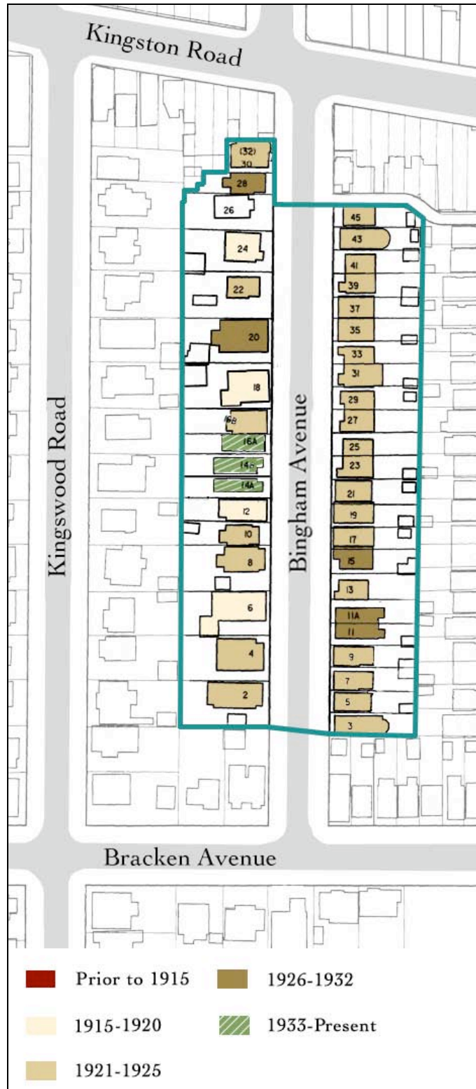
Figure 14. Periods of Development – Bingham Avenue