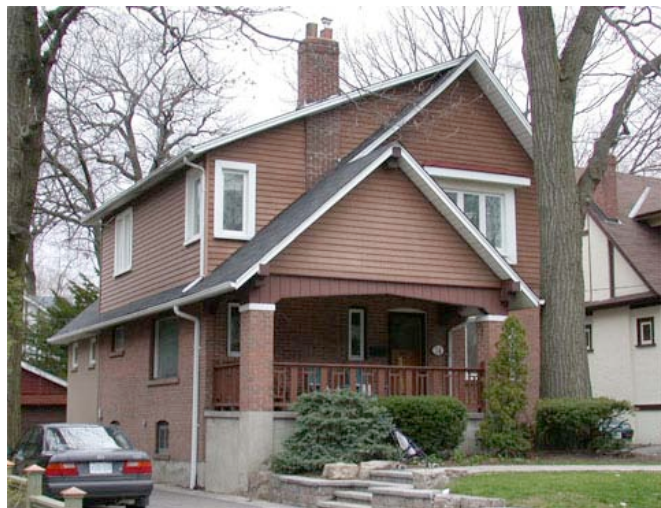
Figure 18.24 Bingham Avenue

Several homes along Bingham Avenue exhibit asymmetrical gables, shed roof dormers, irregular and multi-paned windows, and textured materials. Often, more generally classified as Period Revival, the characteristics of these homes contribute to a picturesque sensibility reminiscent of English cottage designs.