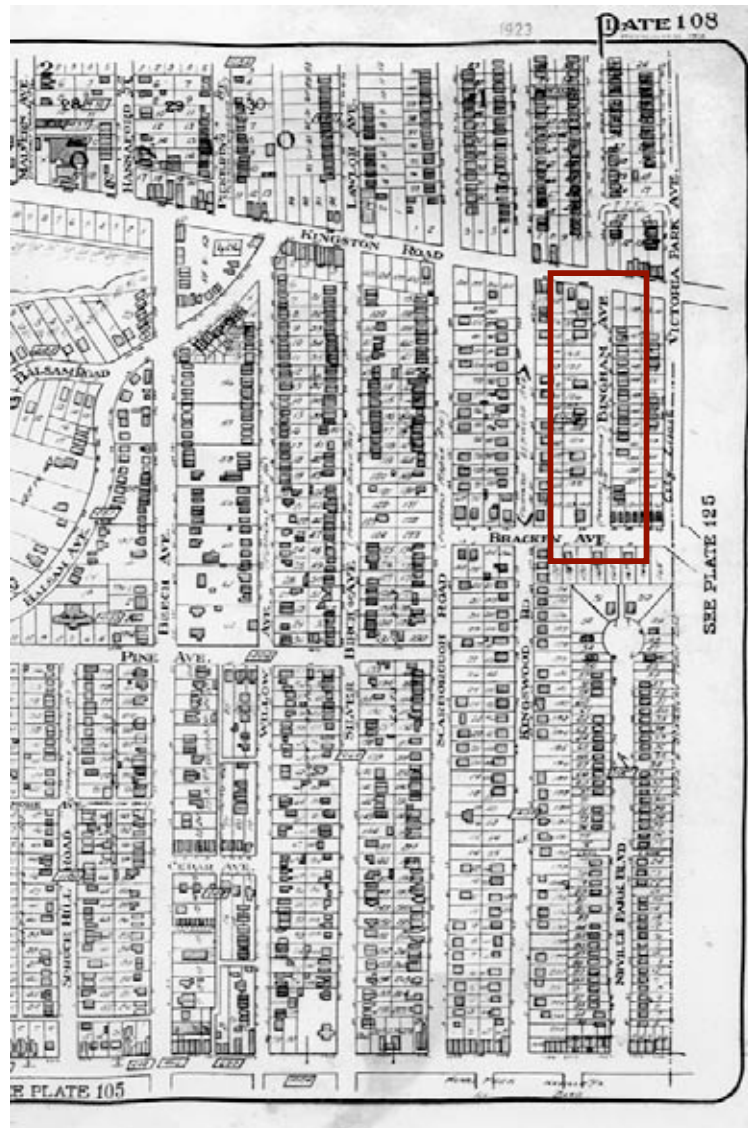
Figure 13. Goad's Atlas 1923

The 1923 Goad's Atlas of the City of Toronto and Suburbs documented that the two sides of the street were being developed differently. Eight detached buildings were on Bingham's west side, each occupying one of Plan 1408's original wide lots. By contrast, the east side had ten detached and eight semi-detached houses, with two dwellings on each of the original lots. Within a year or two, the rest of the lots on the street would be filled similarly.