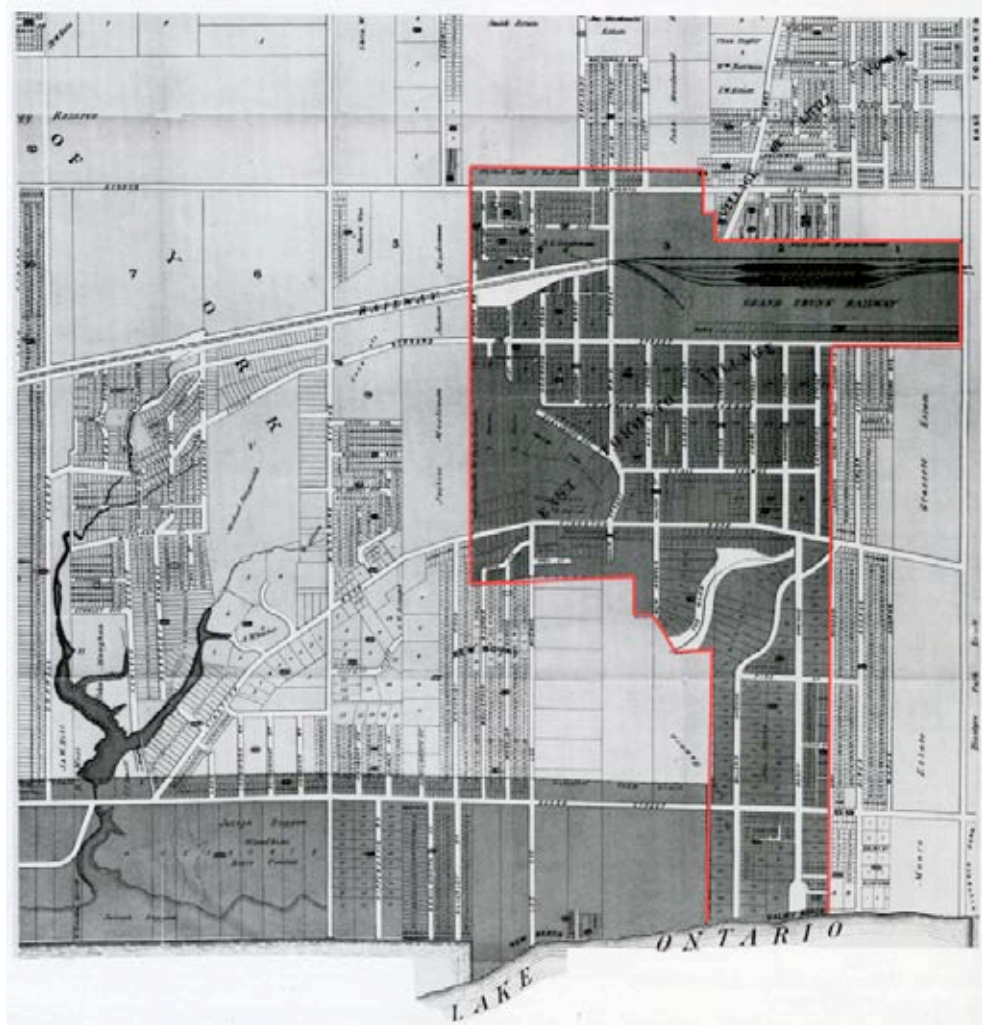
Figure 8. Map of Toronto and Suburbs, East of the Don, including East Toronto Village, 1892