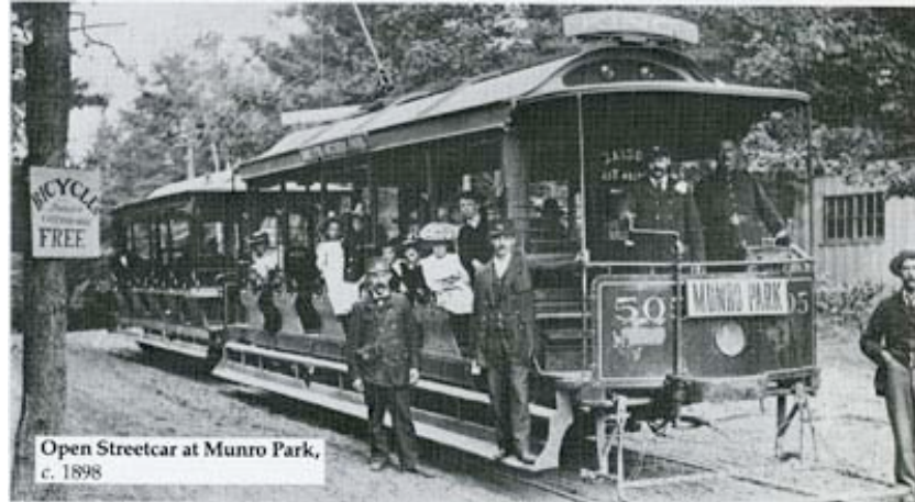
Figure 7. Munro Park Streetcar, circa 1898