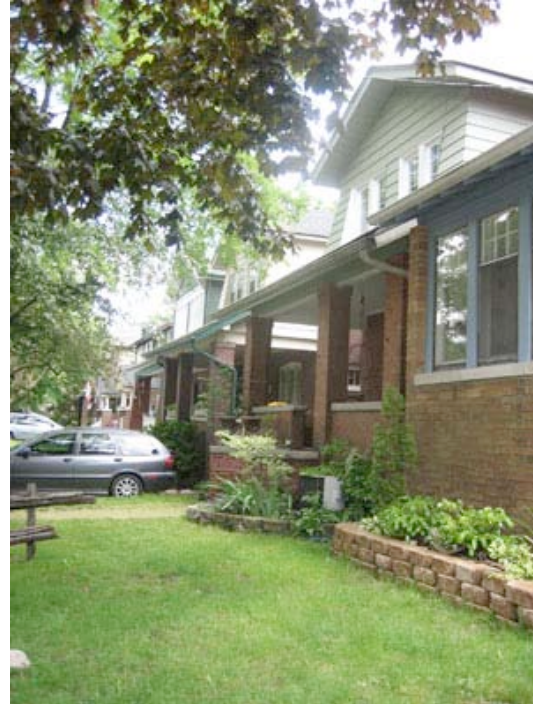
Figure 19. Looking up the east side of Bingham Avenue