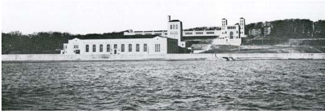
Figure 11. Victoria Park Pumping Station, December 17, 1936.