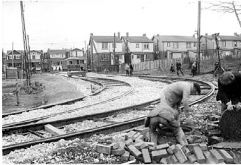
Figure 10. Construction of the Bingham Loop in 1922