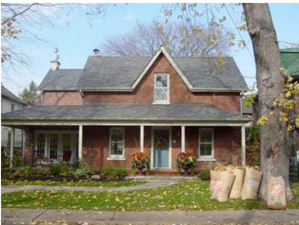
Figure 17. #74 Lyall represents typical Neo-Georgian farmhouse. This style was popular in the latter half of the nineteenth century because its second storey was “hidden”, providing a tax lower rate. While still common in rural Ontario, only a few remain in Toronto.