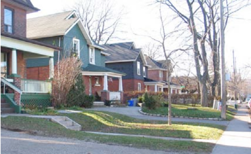
Figure 25. Looking west along Lyall Avenue, 2005.