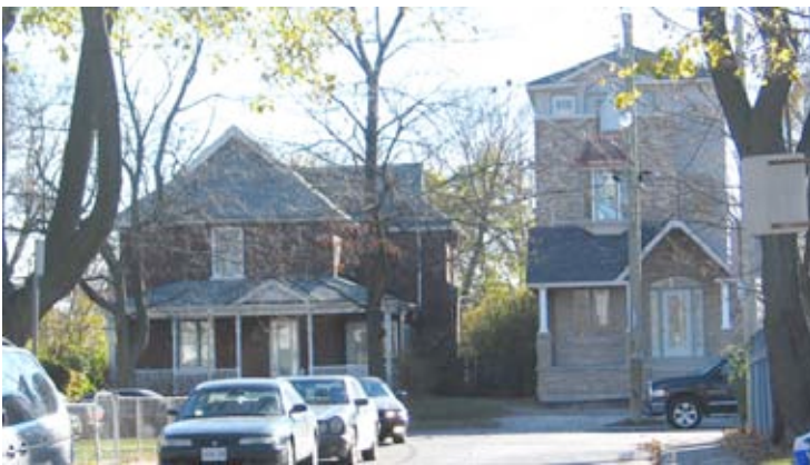
Figure 24. #35B (right) physically overwhelms the vernacular massing of neighbouring #37 c1905.