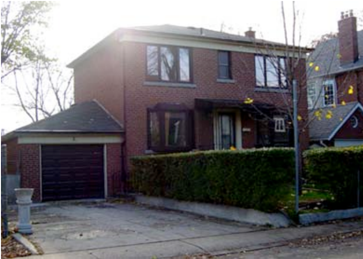
Figure 21. #51 Lyall constructed as infill after 1956 exhibits a style of its time but relates to the neighbourhood in height, setback and material.

Mid-twentieth century developments in the area, though obviously more modern in appearance, are mainly in keeping with the materiality and massing that represent the architectural character of the street. However more recent developments interrupt the rhythm of the street. Through demolitions, extensive alterations and lot splitting these new developments often exceed the typical vertical height of 2-2.5 stories and infringe on established setback lines from the street and spacing between houses. In addition, these developments have largely ignored the materials palette, window types, and architectural detailing common to the area.