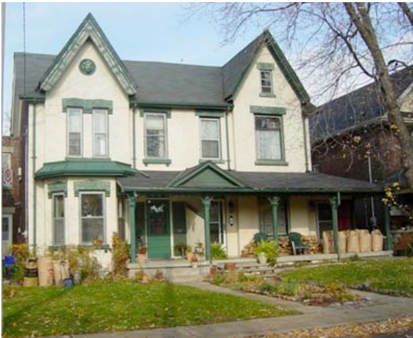
Figure 16. #22 Lyall (left) exemplifies High Victorian details

At least five houses on the street have survived from the 19 th century, including #22, #38, #50, #62, and #74, each possessing a building type unique to the street. The mode, size and architectural character of these Victorian era buildings mesh well with the simple style and detailing of the more prevalent turn-of-the-century architecture of the street.