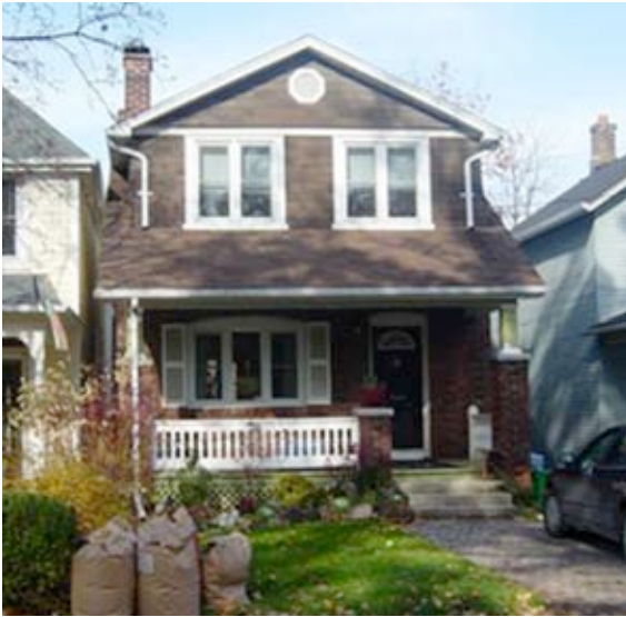
Figure 20. #48 Lyall is an example of Toronto Bungalow design

While Edwardian Classicism is the dominant architectural style for early 20 th Century development along Lyall, a few properties exhibit low-pitched roofs, wide verandas and varied building materials typical of bungalows in Toronto. This cottage-like construction is typical of many streets to the south in the Beach.