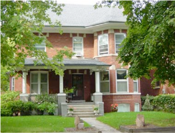
Figure 18. #6 Lyall exhibits simple stone accents typical of Edwardian styles

The majority of the houses on the street can be identified as having distinct features of Edwardian Classicism with simple, balanced (if not symmetrical) designs, and many windows. Lyall Avenue is dominated by the typical Toronto Edwardian four-square model. This large and practical brick house type displays robust but simple wood detailing most often found in the gable. Many houses on the street of the same vintage, though not of the classic four-square prototype, are similar in their massive and solid brick structures, often with different window detailing and expansive porches.