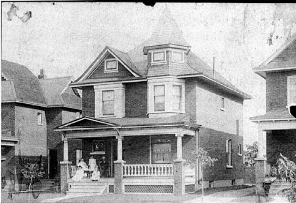
Figure 11. #33 Lyall c1910