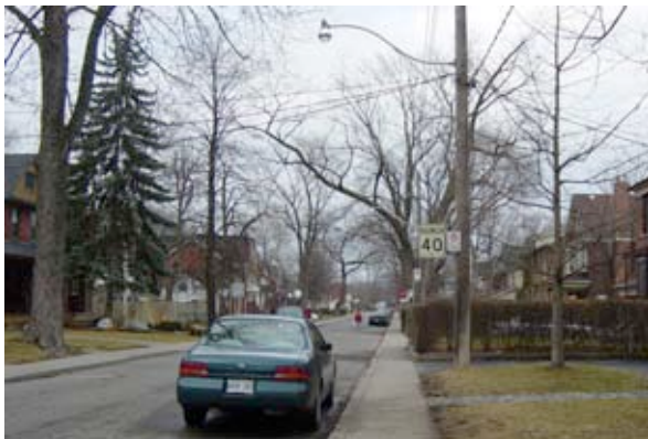
Figure 15. Looking east from in front of #47 Lyall in March 2006. The street and the houses have changed little, while the tree canopy remains largely intact.