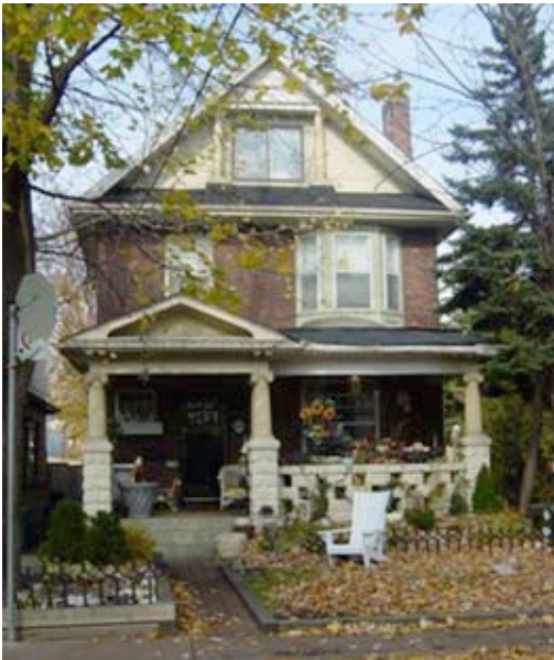
Figure 19. #26 Lyall shows square and simple design