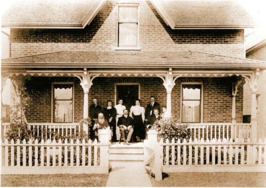
Figure 10. #74 Lyall in the late 1890s