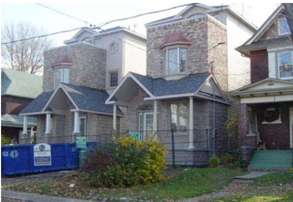
Figure 23. Splitting the original 50 ft lot, new developments #35A + B disregard established character in massing, lot occupation, materials and setbacks.