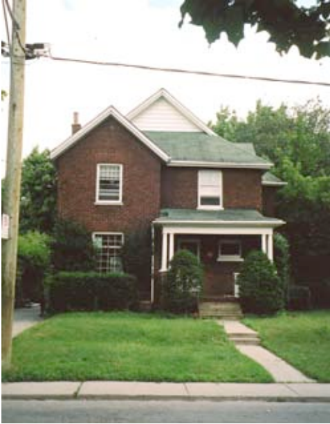
Figure 22. #35 Lyall c1905 demolished 2004.