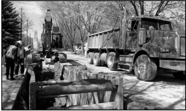
Example open-cut construction in a road

Work will typically take place from 7:00 a.m. to 7:00 p.m., Monday through Friday, and from 9:00 a.m. to 5:00 p.m. on Saturday. No construction work will not be permitted on Plymbridge Road between 8 a.m to 9:15 p.m., and between 2:30 p.m. and 4:30 p.m., Monday through Friday, to accommodate Hillcrest School.