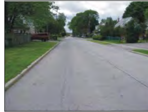
Before (Aylesworth Ave)

In order to control and reduce the impacts of Combined Sewer Overflow, the implementation of conveyance controls, such as bio-retention units, as in the example shown, will assist in improving the quality and reduce the quantity of stormwater before it is discharged from the sewer system to a downstream location.