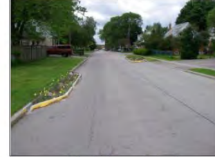
After (Aylesworth Ave)

The bio-retention units will be located at specific locations along Aylesworth Avenue and Natal Park public right-of-way. They are to be designed approximately 5.0m long by 1.5m wide.