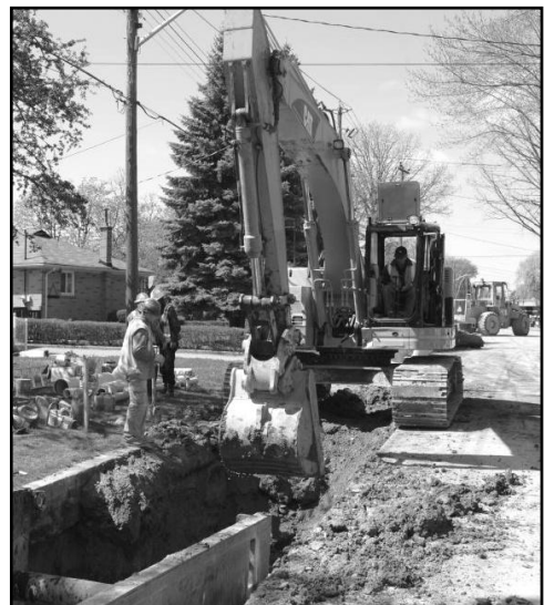
Example watermain construction

The contractor will further notify you of any temporary disruptions. Every effort will be made to reduce the inconvenience. The City appreciates your understanding and co-operation.