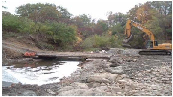
Example of construction of creek restoration