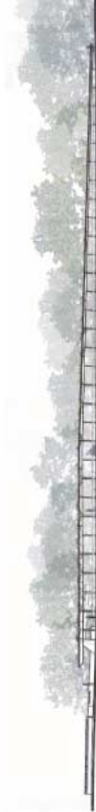
Leslie Street - East Elevation