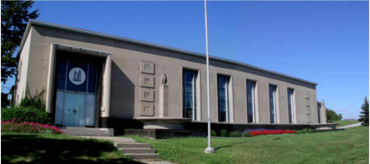
1144 Lawrence Avenue West (Lawrence Pumping Station) – south elevation