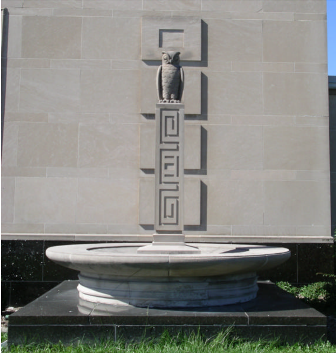
1144 Lawrence Avenue West (Lawrence Pumping Station) – Sculptural elements resembling fountains