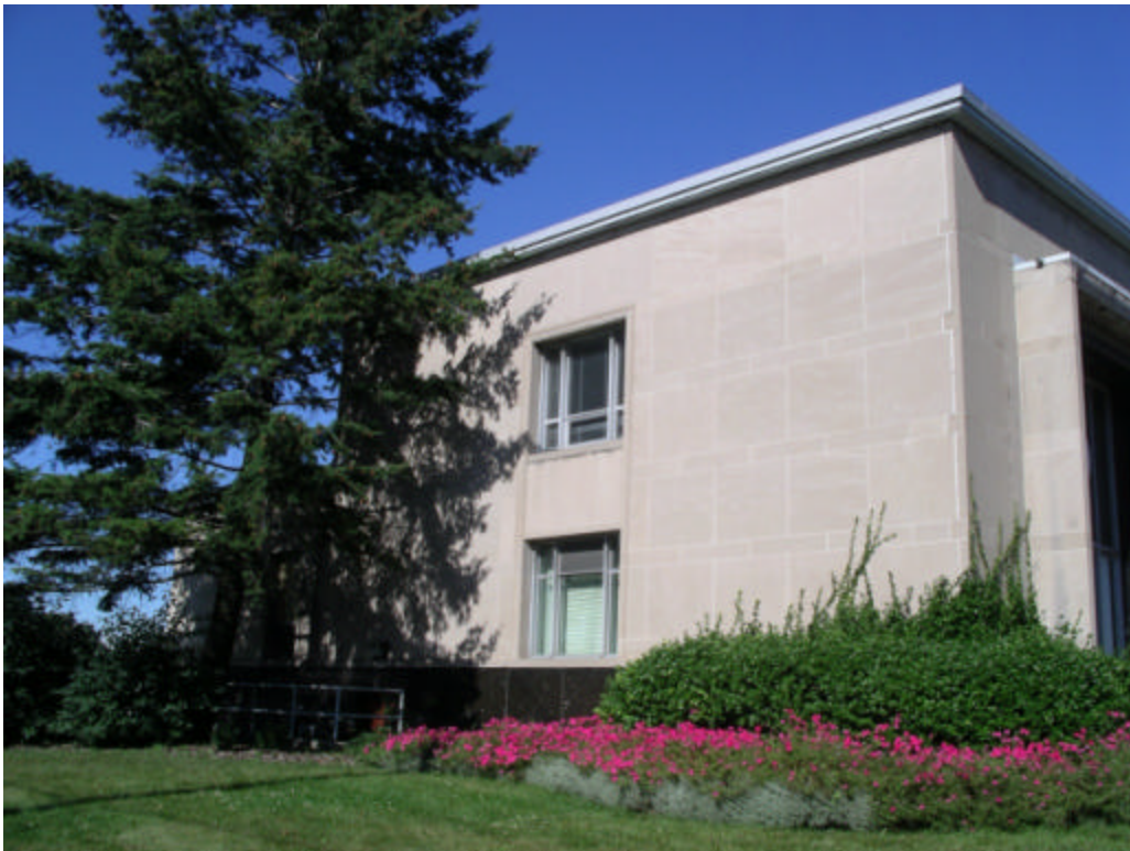
1144 Lawrence Avenue West (Lawrence Pumping Station) – west elevation