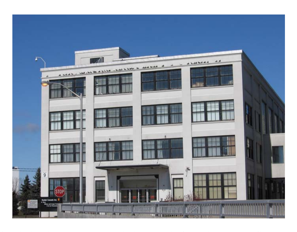
Employees' Building (also known as Building No. 9), Canadian Kodak Company, showing the principal (south) façade