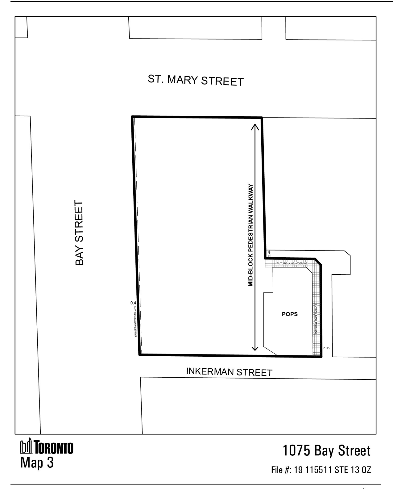
12 City of Toronto By-law - 2021