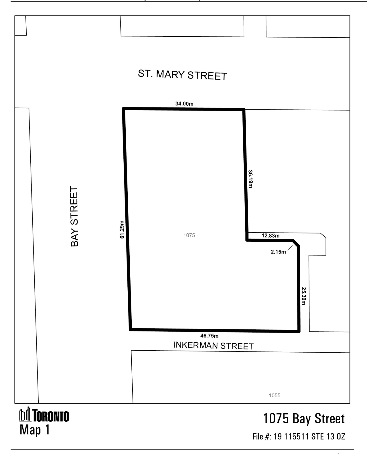
10 City of Toronto By-law - 2021