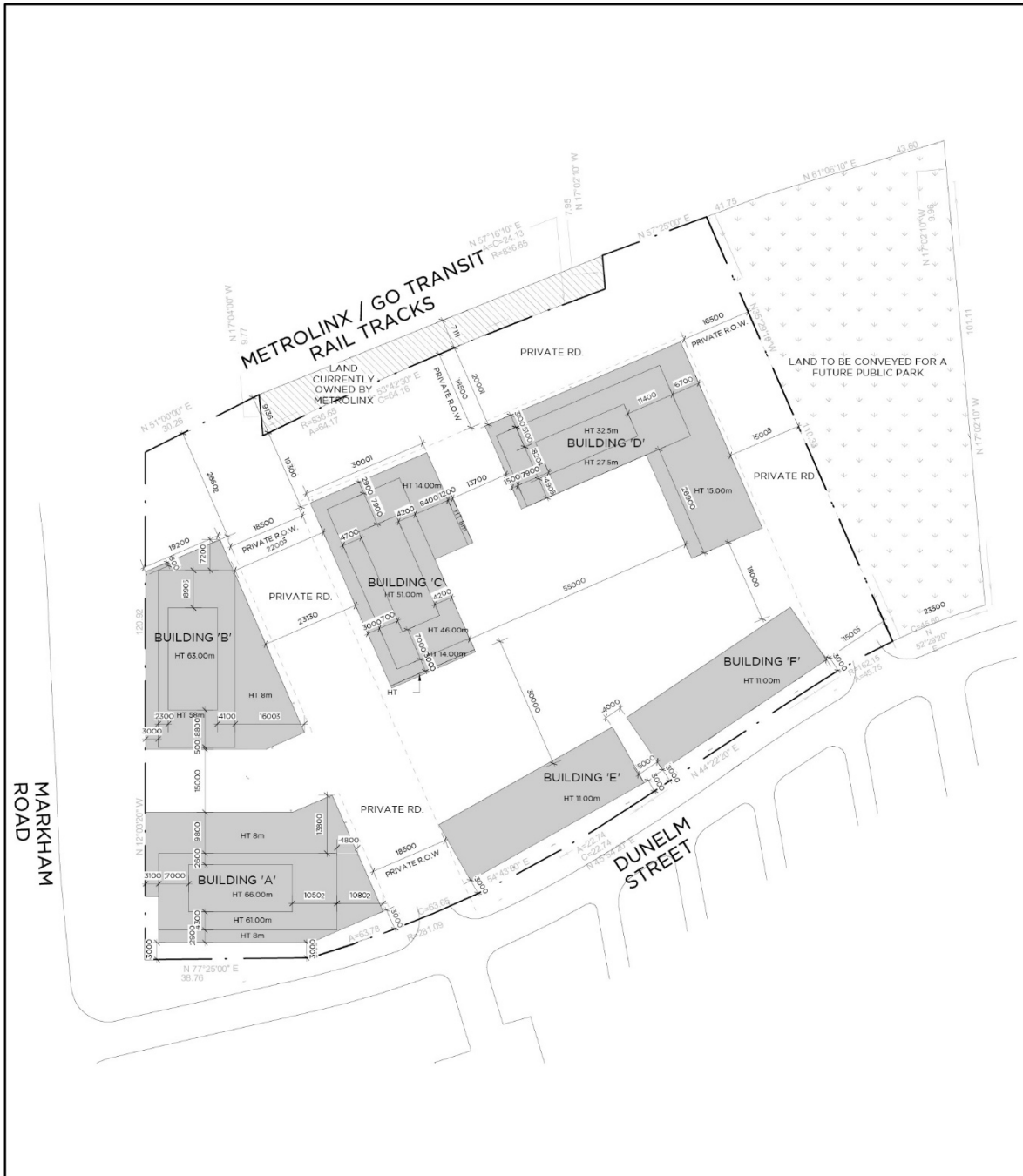
TORONTO Diagram 3

253 Markham Road and 12, 20, 30 Dunelm Street File # 16 173545 ESC 36 02