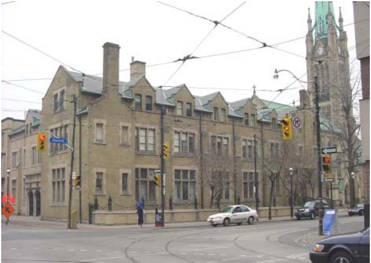
ST. JAMES' PARISH HOUSE AND DIOCESAN CENTRE 106 KING STREET EAST, TORONTO, WARD 28