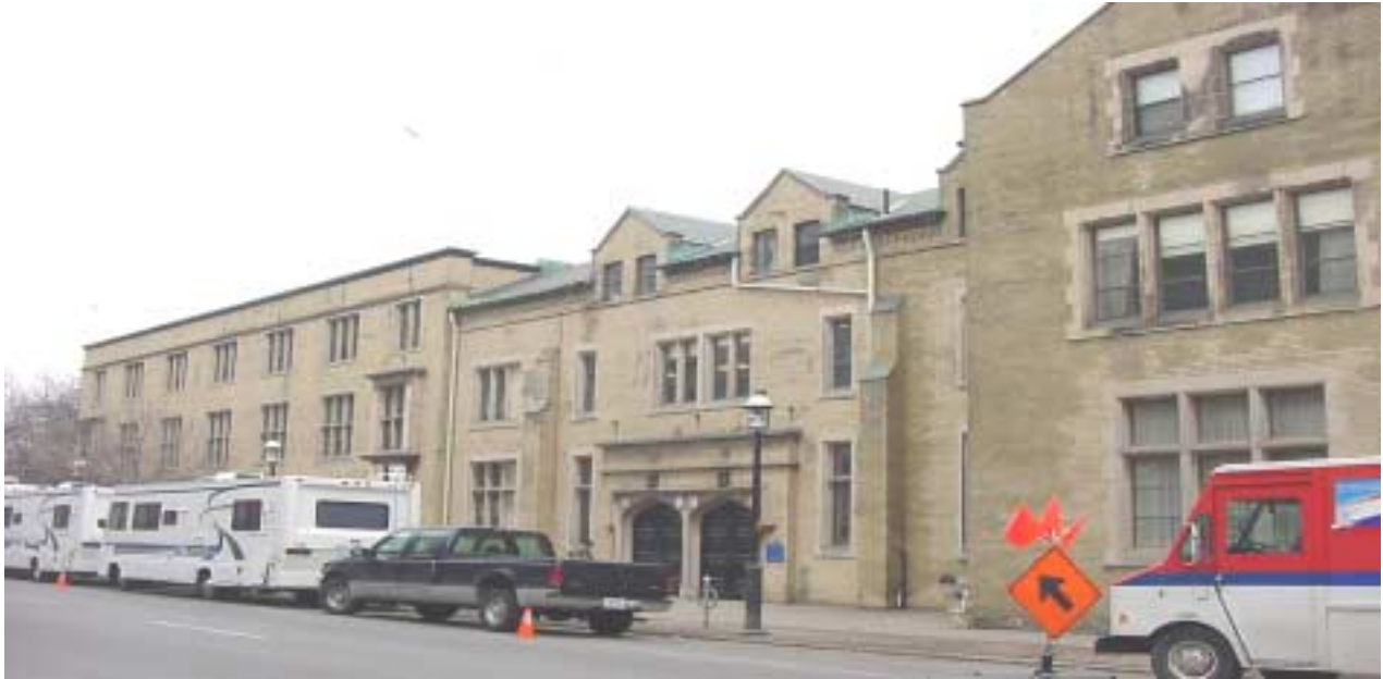
View showing the north walls of St. James' Parish House (right) and Diocesan Centre (left)