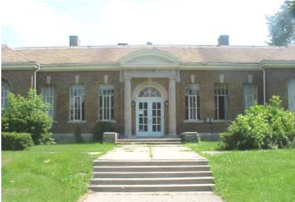
Detailed view of principal (north) facade