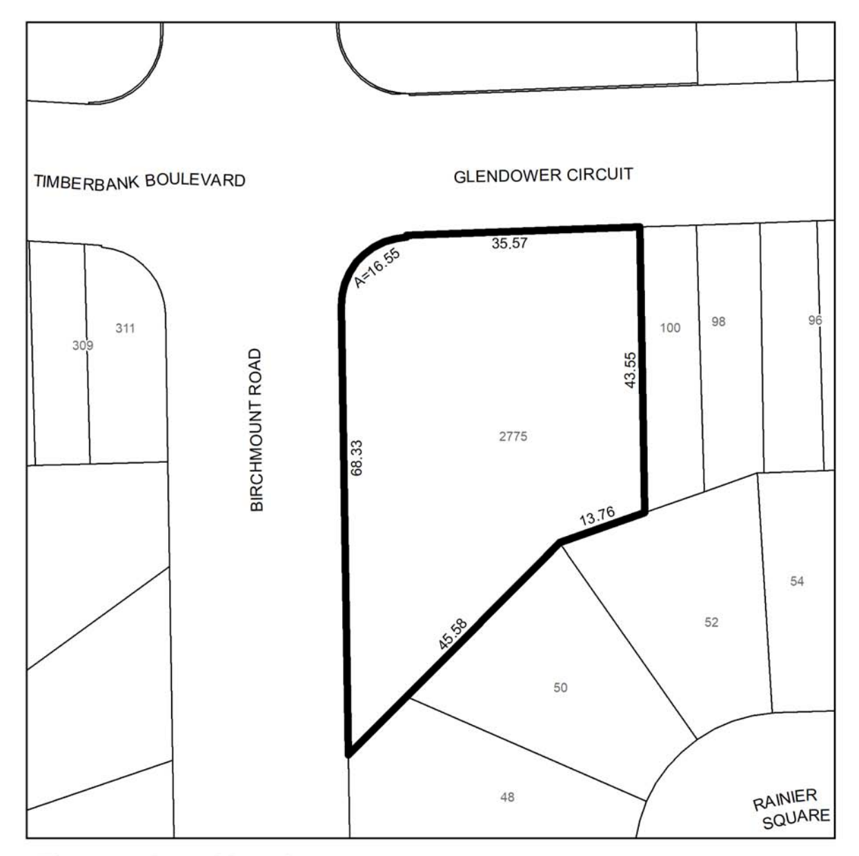
Exception No. 97