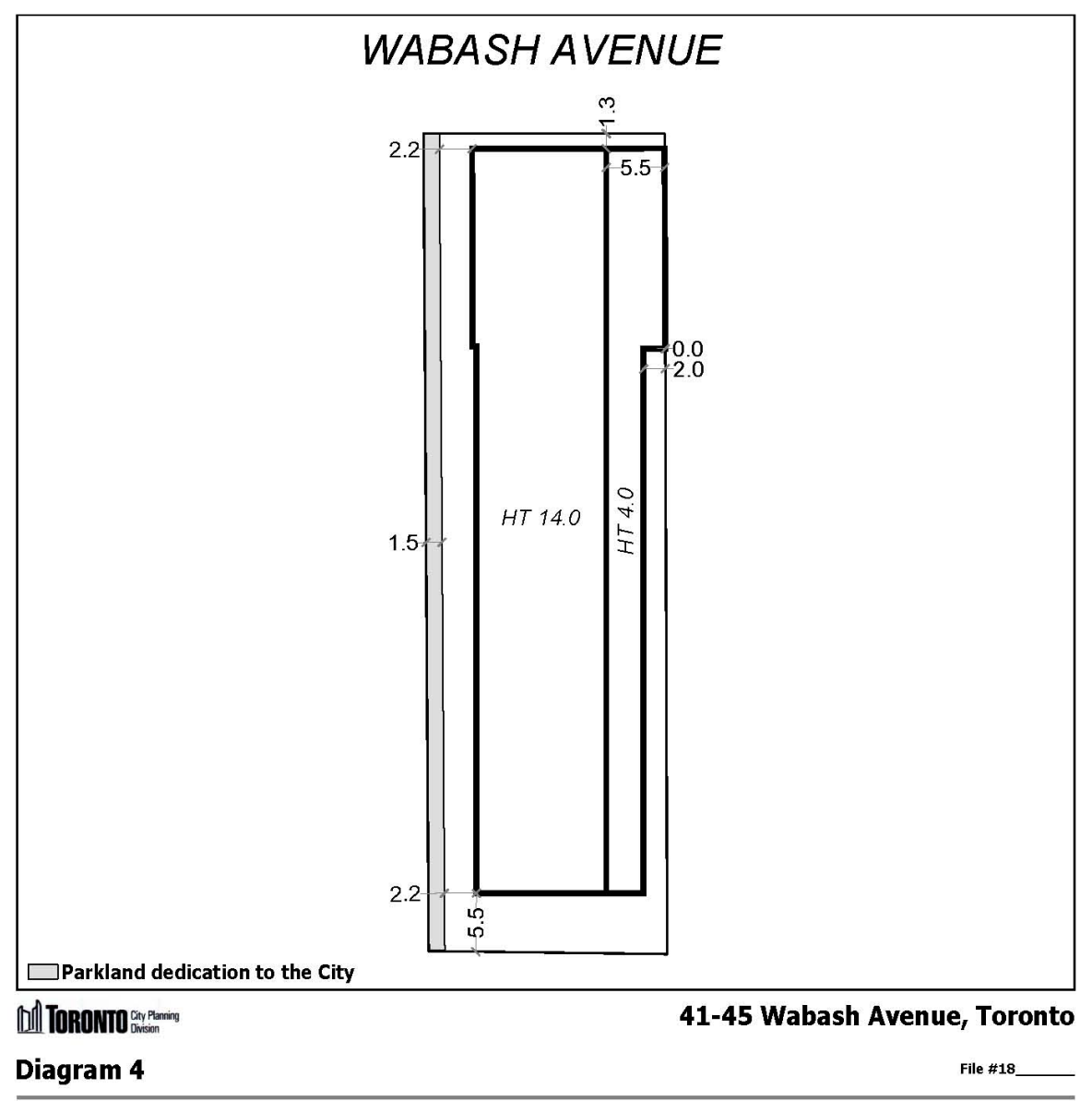
8 City of Toronto By-law 940-2020