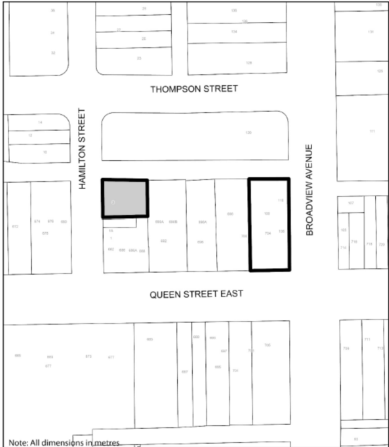
TORONTO Diagram 1

106-110 Broadview Avenue, 704 Queen Street East and 3 Hamilton Street