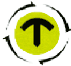
Toronto Business Development Centre