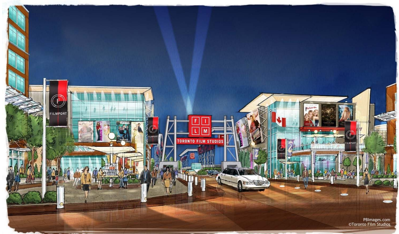
Main Entry to Studio Complex

Toronto Economic Development Corporation