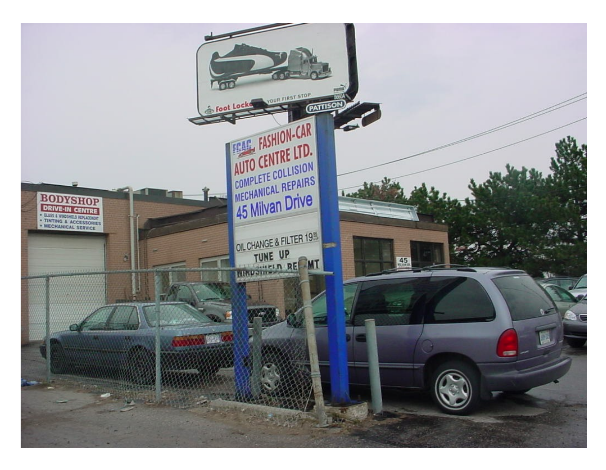
Front elevation for 45 Milvan Dr Pylon sign shown in picture is the sign that applicant proposes to replace.