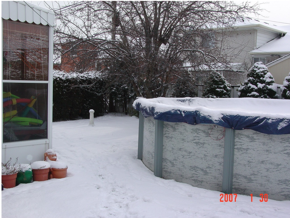
Photograph showing the pool relative to the house (looking south east)