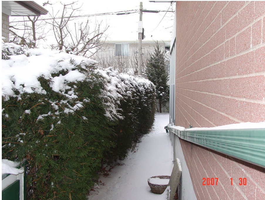
Fence on the east elevation partly covered by a cedar hedge