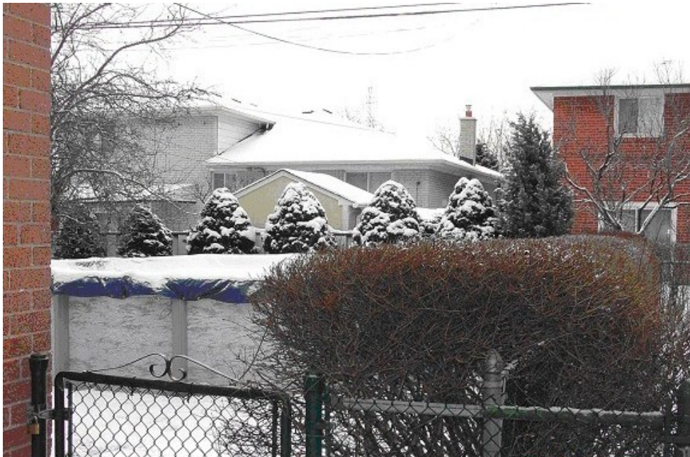
Photograph showing the entrance gate and the fence on the west side (the mesh here which is 32 millimetres (1¼ inches) in size is in compliance)