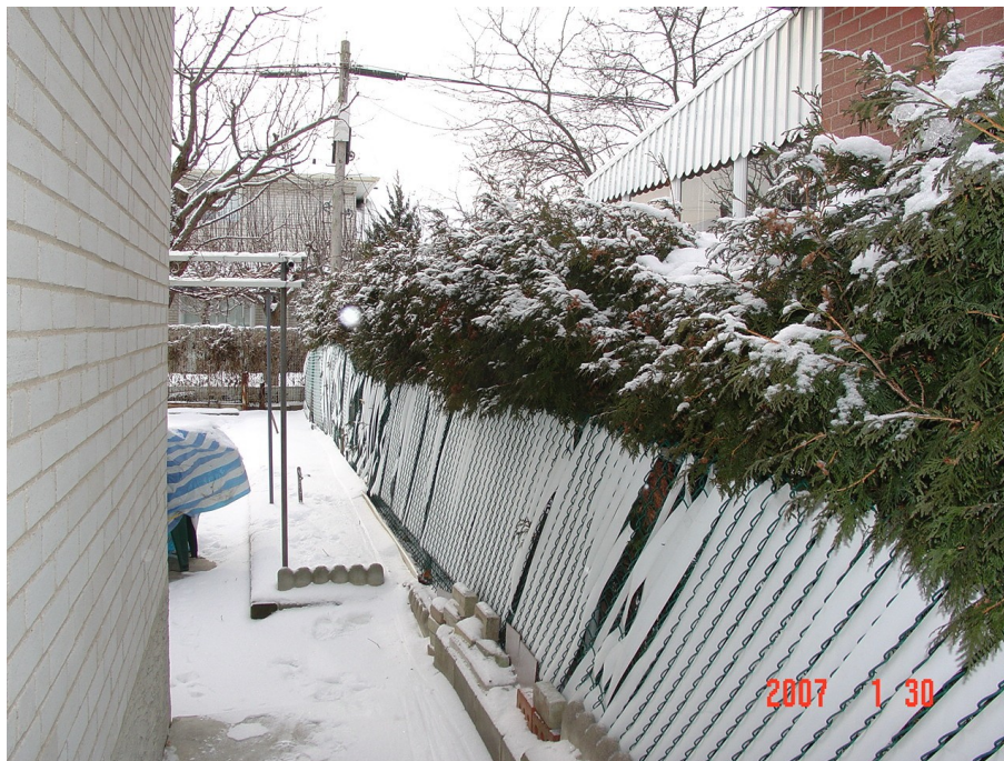
Photograph showing the subject fence on the east elevation Taken from the neighbouring property at 66 Frost Street (Note: The fence appears to be out of plumb because of the way that the vinyl slats are woven)