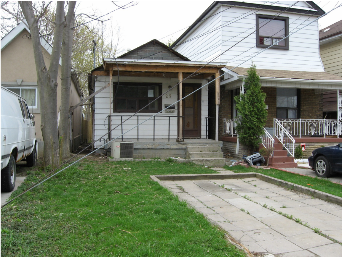
25 Locust Street – Front Elevation