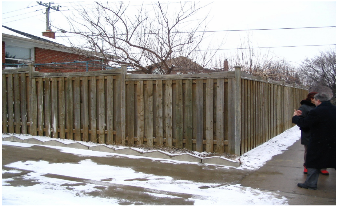
Photograph #1 - Showing the Southeast corner of the property/fencing