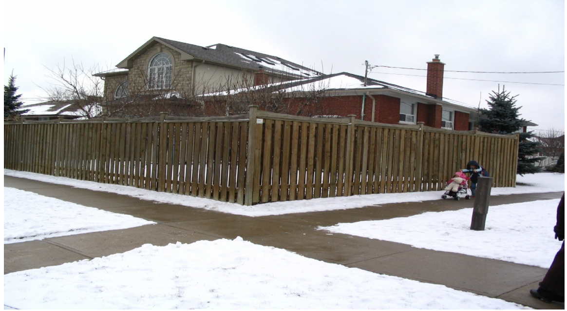
Photograph # 2 - Showing the East and South elevations of the front yard fencing