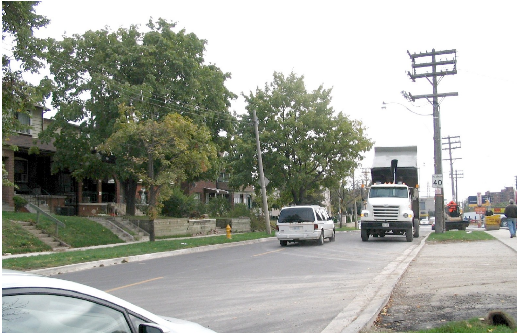
Photo showing houses on the east side of Caledonia Road across from the Plant