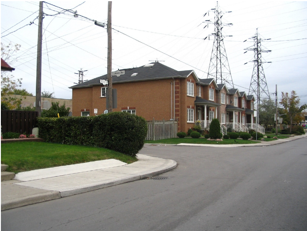
Photo showing houses on Prescott Avenue at the rear of the Plant