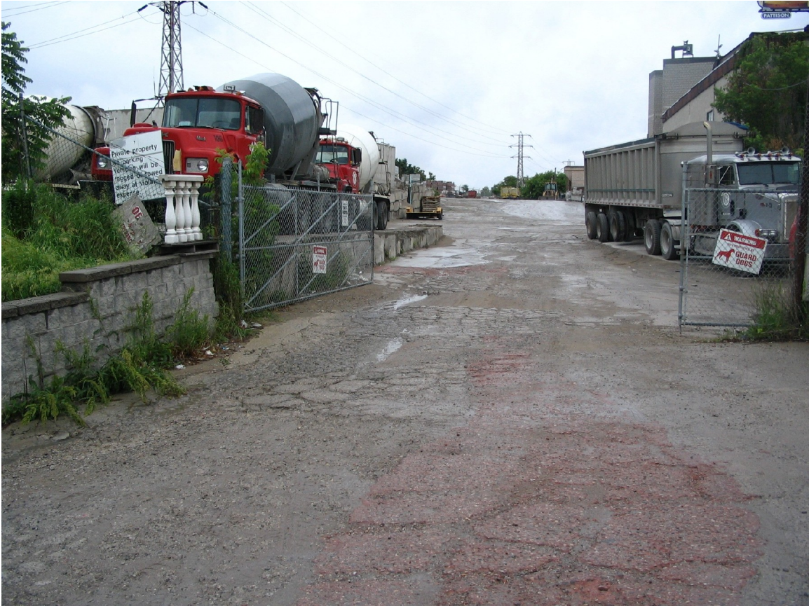
Attachment 5: Main Vehicular entrance to Plant on St. Clair Avenue West