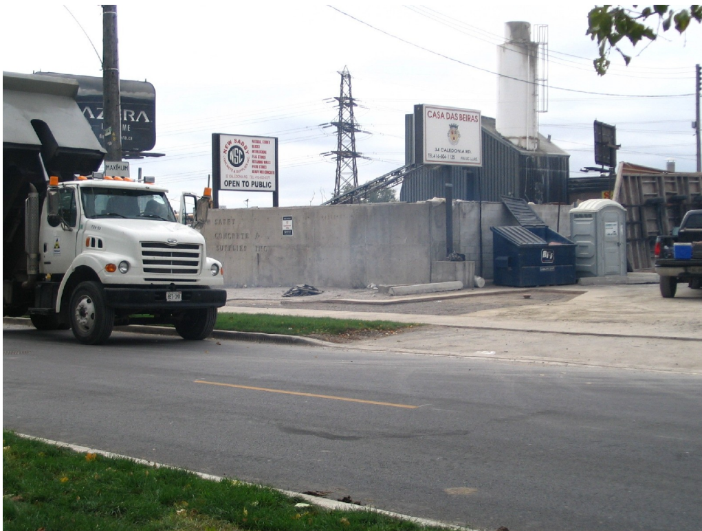
Attachment 3: Photos showing the Plant at Caledonia Road entrance