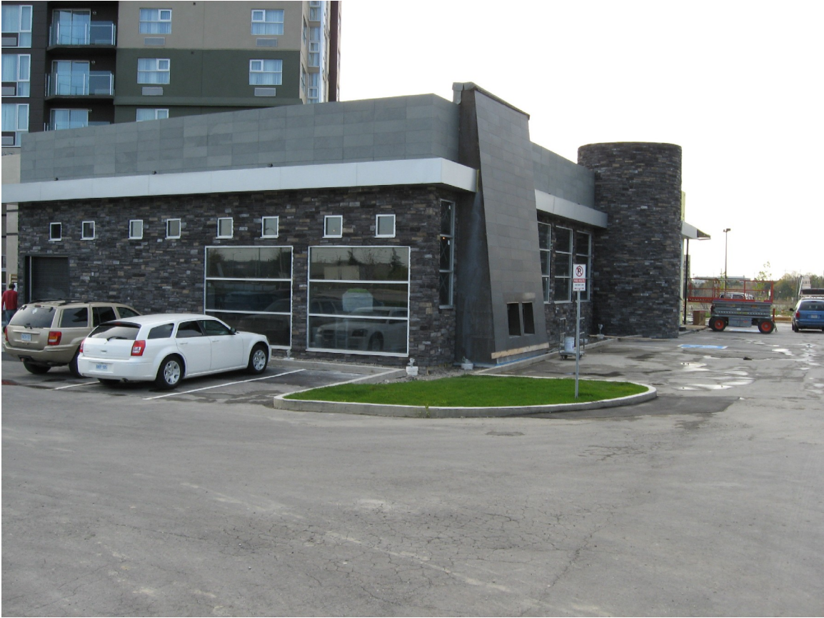
North - East Elevation of restaurant