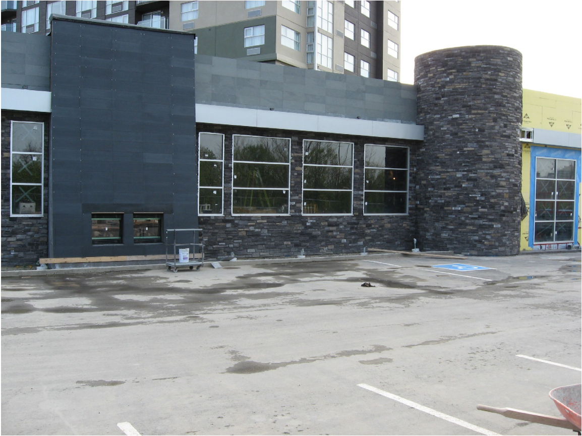
East Elevation of restaurant