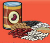
Cooked legumes 175 mL (¾ cup)