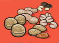
Shelled nuts and seeds 60 mL (¼ cup)