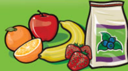
Fresh, frozen or canned fruits 1 fruit or 125 mL (½ cup)