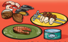
Cooked fish, shellfish, poultry, lean meat 75 g (2 ½ oz.)/125 mL (½ cup)