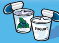
Yogurt 175 g (¾ cup)