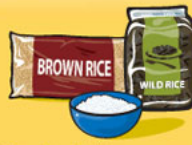
Cooked rice, bulgur or quinoa 125 mL (½ cup)