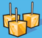
Cheese 50 g (1 ½ oz.)