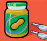
Peanut or nut butters 30 mL (2 Tbsp)