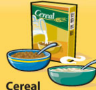
Cereal Cold: 30 g Hot: 175 mL (¾ cup)