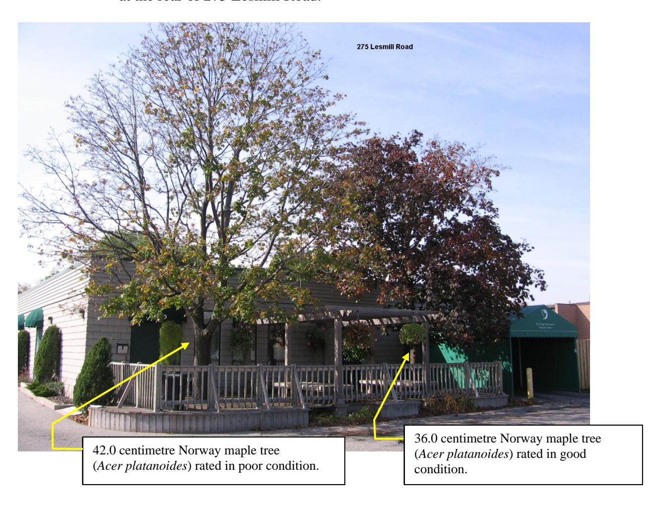
Attachment 1 – Photograph showing the 36-cm and 42-cm diameter Norway maple trees at the rear of 275 Lesmill Road.