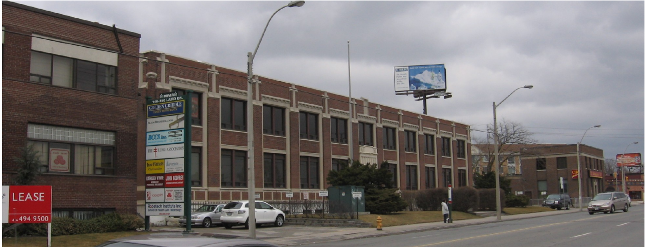
View looking north along the west side of Laird Drive, showing the former Durant Motors Office Building in the centre of the photograph.