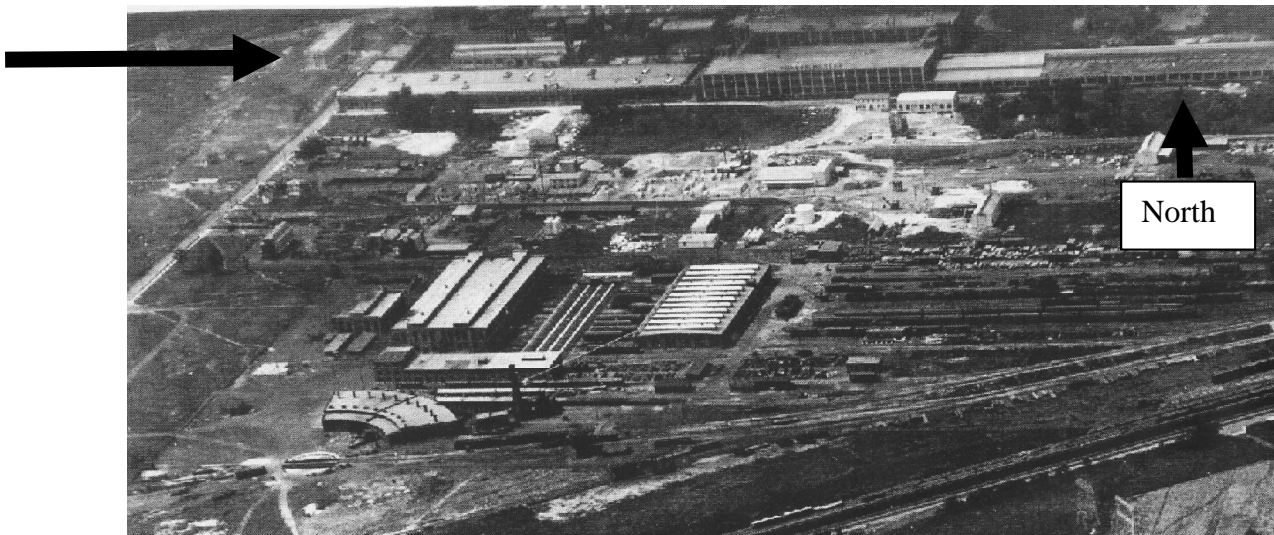
The long arrow (left) shows the location of the building at 150 Laird Drive, which faces east toward Laird Drive with the factory complexes developed by Durant Motors of Canada and the Canada Wire and Cable Company on the east (right) side of the street. The former Canadian Northern Railway yard is shown at the bottom of the photograph, where the building now identified as 85 Laird Drive is included on the City of Toronto Inventory of Heritage Properties.