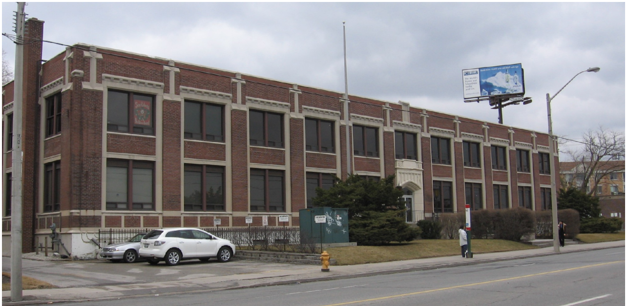
View of the principal (east) façade of the former Durant Motors Office Building.