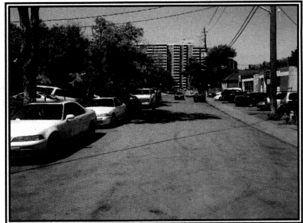
THORA AVENUE NORTHBOUND SOUTH OF WAKEHOOD STREET