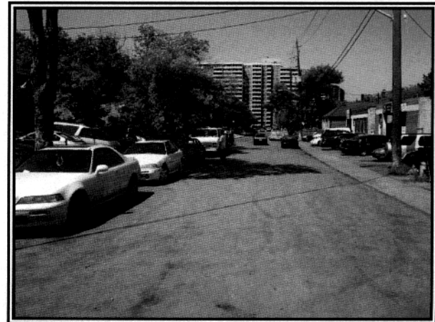
THORA AVENUE NORTHBOUND SOUTH OF WAKEHOOD STREET