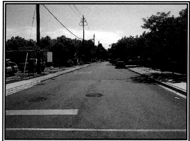
THORA AVENUE SOUTHBOUND AT DANFORTH AVENUE