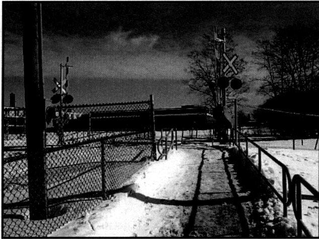
PEDESTRIAN CROSSING AT MILEAGE 59.96