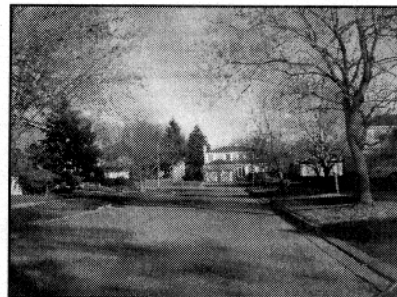
FARMINGTON CRESCENT EASTBOUND EAST OF BELGREEN