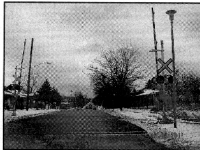
HAVENDALE RD. EASTBOUND EAST OF BELGREEN AVE.