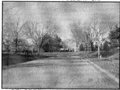
BELGREEN AVE. NORTHBOUND AT SOUTH CURVE