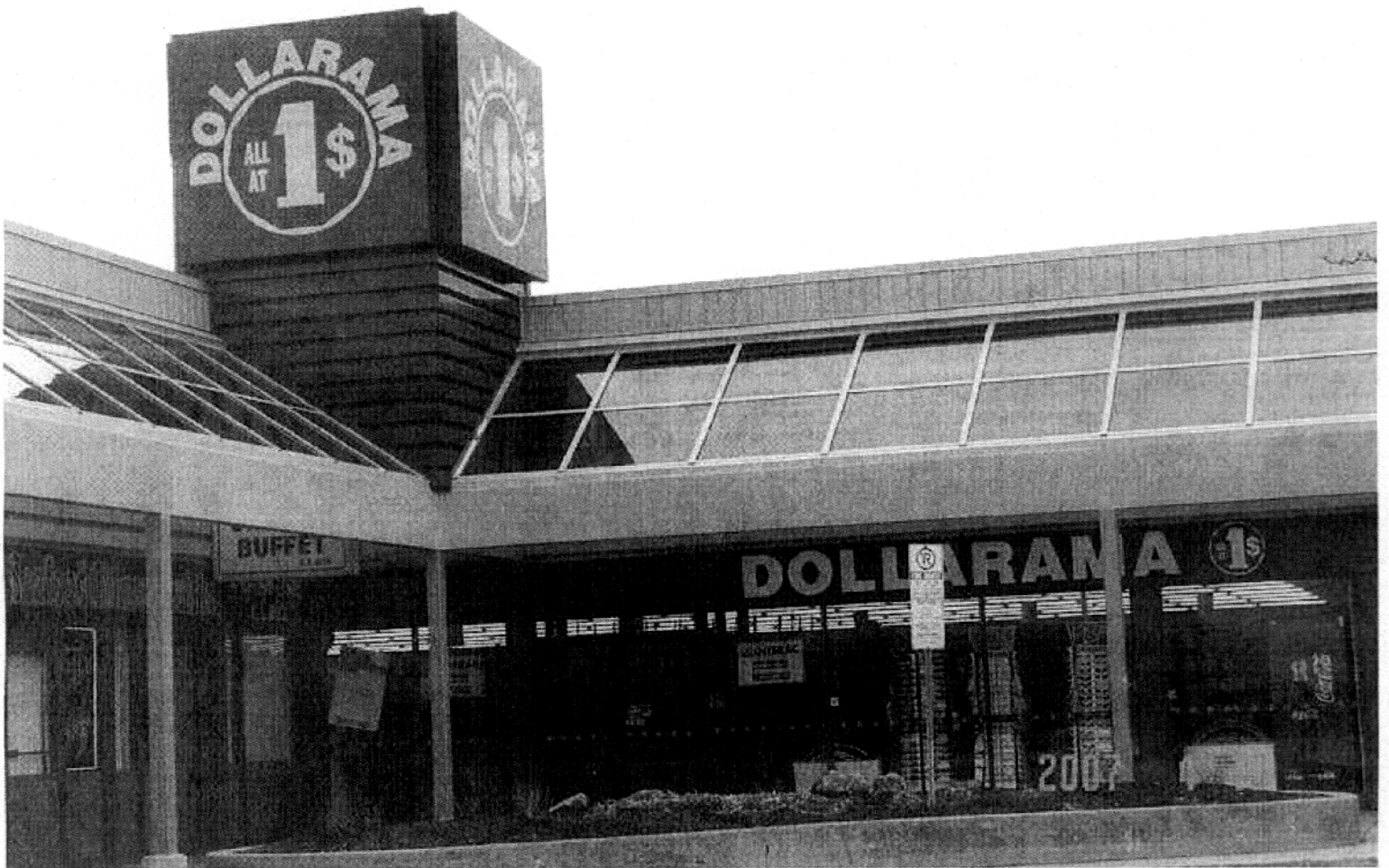
ATTACHMENT 3 CLOSE-UP VIEW OF NEW SIGNS