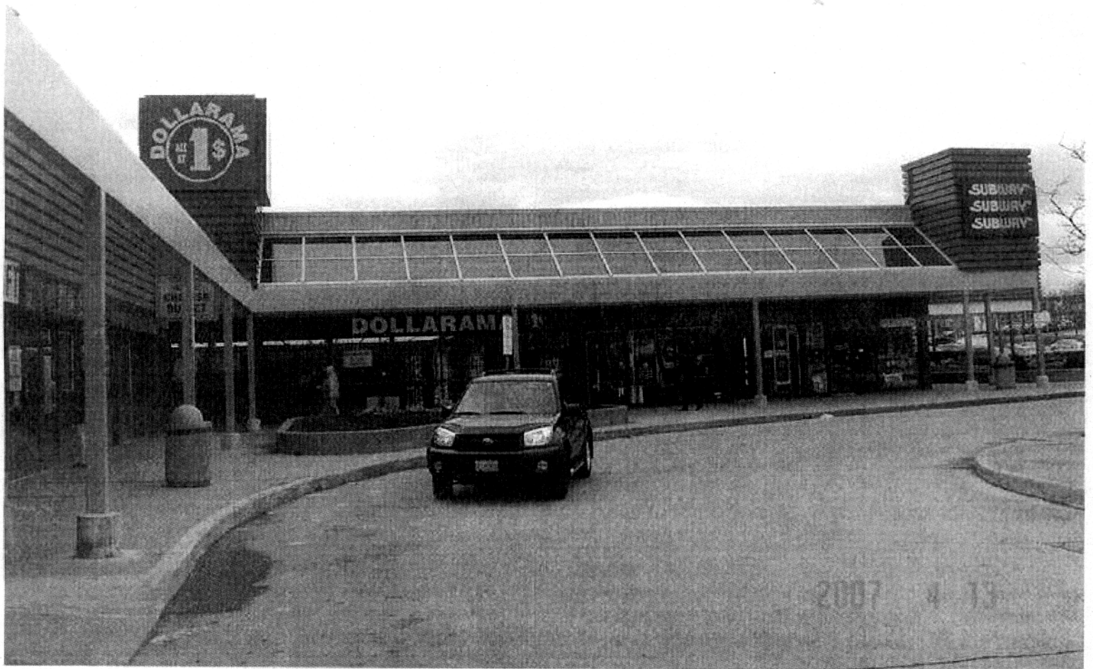
ATTACHMENT 4 VIEW WITH NEW AND EXISTING SIGNS