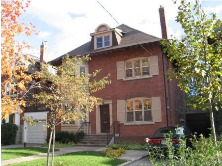
29 St. Andrews Gardens – Front (South) Elevation