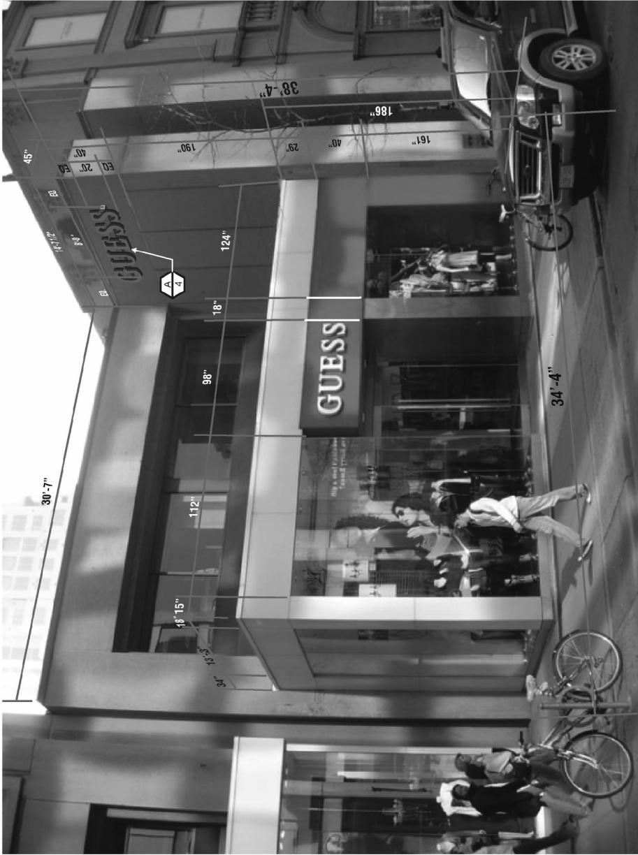
Photo Elevation - Front