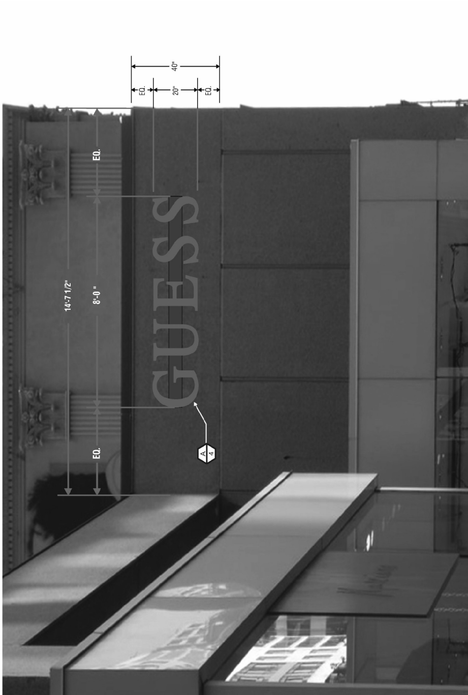
Photo Elevation - Side