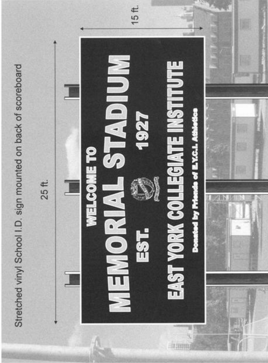
Stretched vinyl School I.D. sign mounted on back of scoreboard