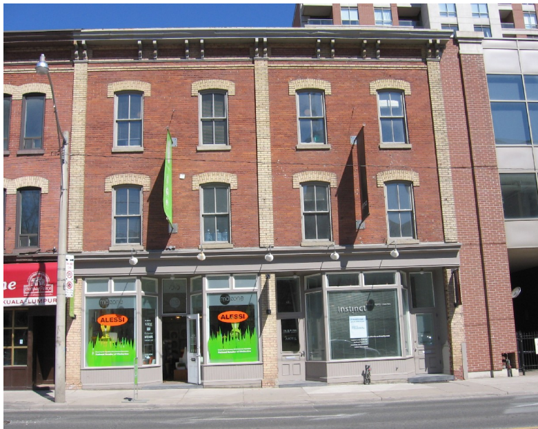
Principal (west) facades of the Clarkson Jones Buildings

This location map is for information purposes only; the exact boundaries of the properties are not shown