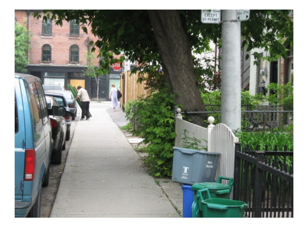
431 King Street East – Trinity Street Flank, neighbouring properties June 1, 2007