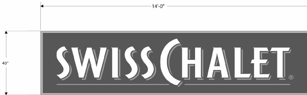
LETTERS FRONT ELEVATION VIEW