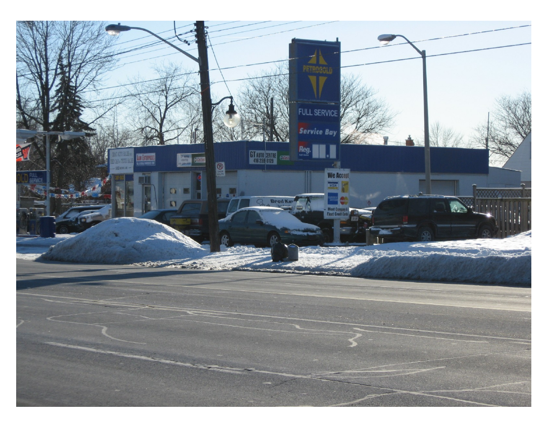
East and North Elevation