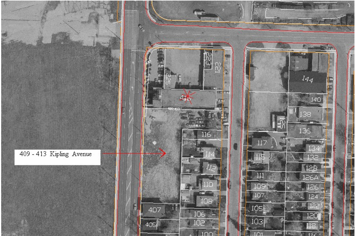
Attachment 3: Aerial map showing the location of property