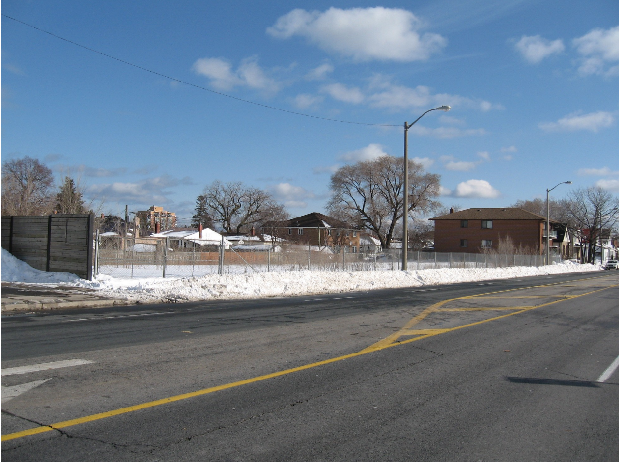
Attachment 5: Photograph showing the Property looking south