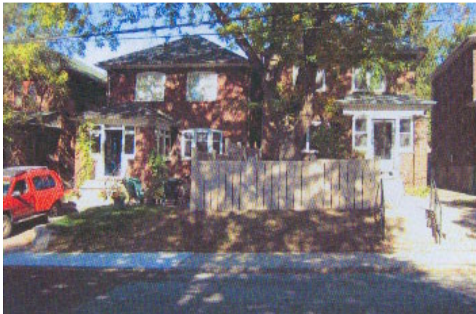
Attachment 2 – Fence profile for road allowance and private property