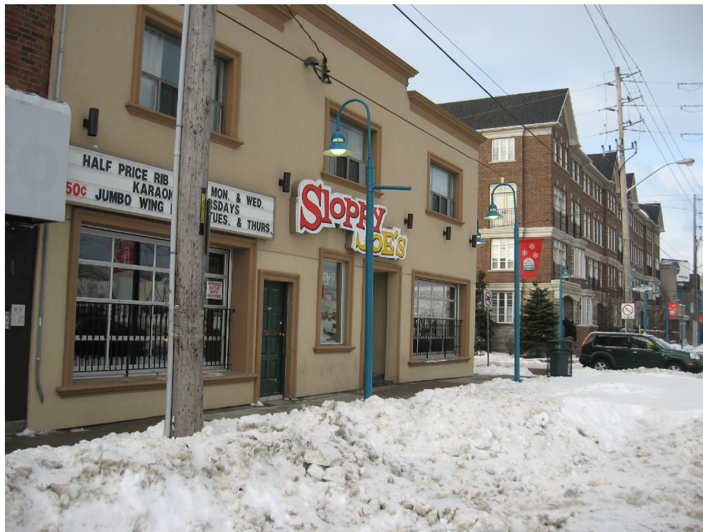
Attachment 2: Photos showing the Business (Outdoor Café not in operation)

Request to extend the operation hours of an Outdoor Boulevard Café - 3527 Lake shore Blvd. W.