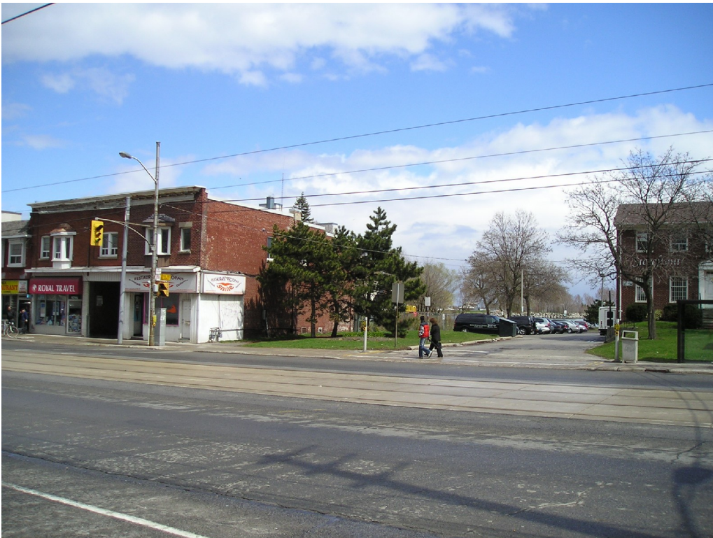
Side Elevation and Park