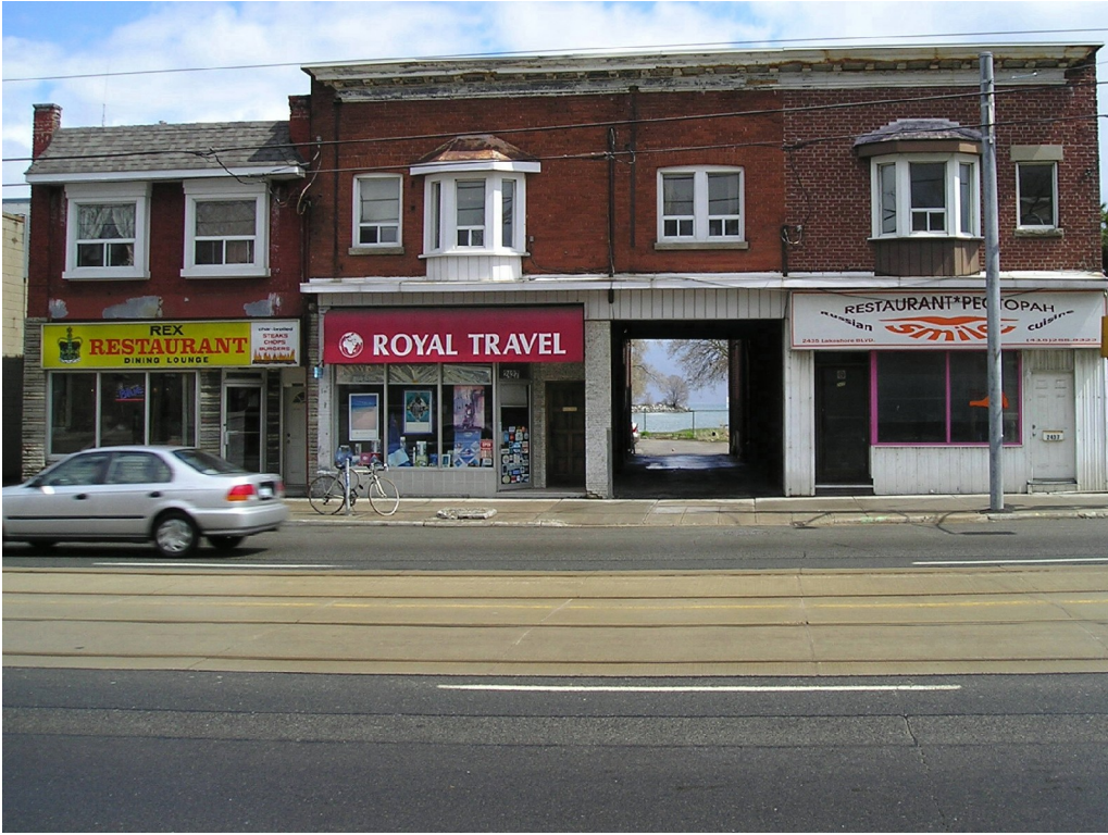
2423 to 2437 Lake Shore Blvd W – Front Elevation